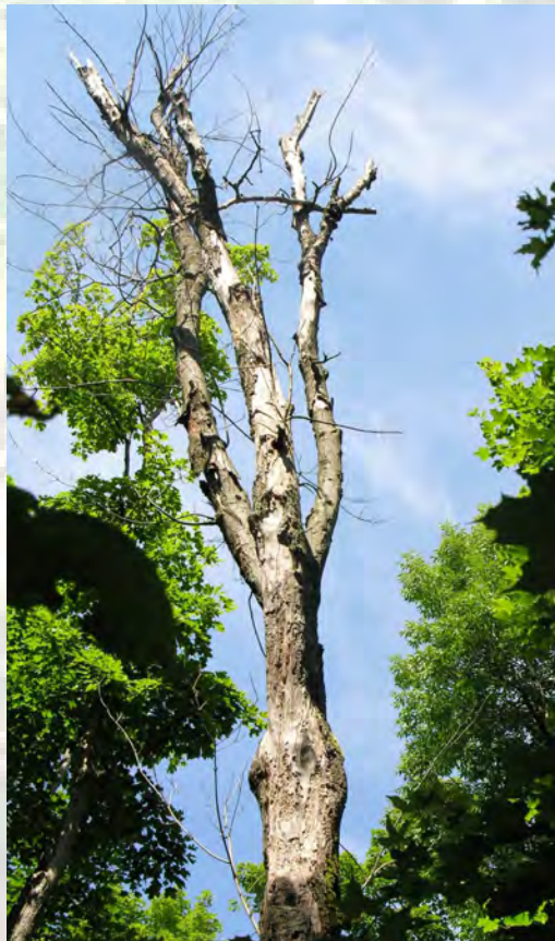
Dead trees are important structures in the Park and provide excellent habitat for a variety of species including Pileated woodpeckers.

Measures of forest structure, including, for example the sizes of trees, the amount of deadwood in the forest, as well as variations in the height of ground vegetation, were taken in field plots that were set up in the Park. These data provided ground information in order to build and calibrate models developed from remotely sensed imagery and topographic data. Various pieces of information, including