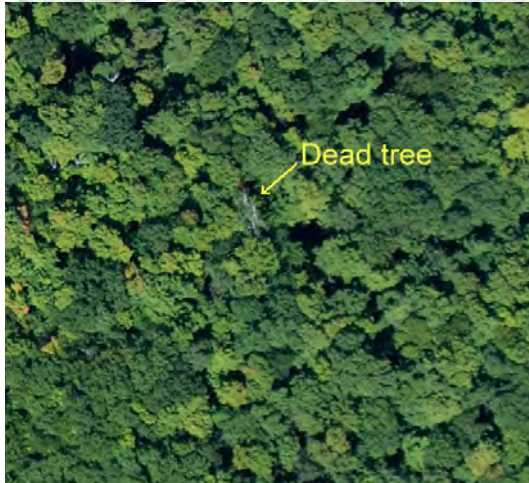
Example of an air photo showing individual tree crowns, shadows in the canopy, and individual dead trees, which all provide information that can be used to model and map structural complexity.

measurements of the canopy and shadows in the forest, were then extracted from the air photos at the exact locations (known from field measurements using sub-meter GPS equipment). This information was used to explain the structural complexity that was measured on the ground. These computer based models were then used to create spatially continuous maps of predicted structural complexity across the forest.